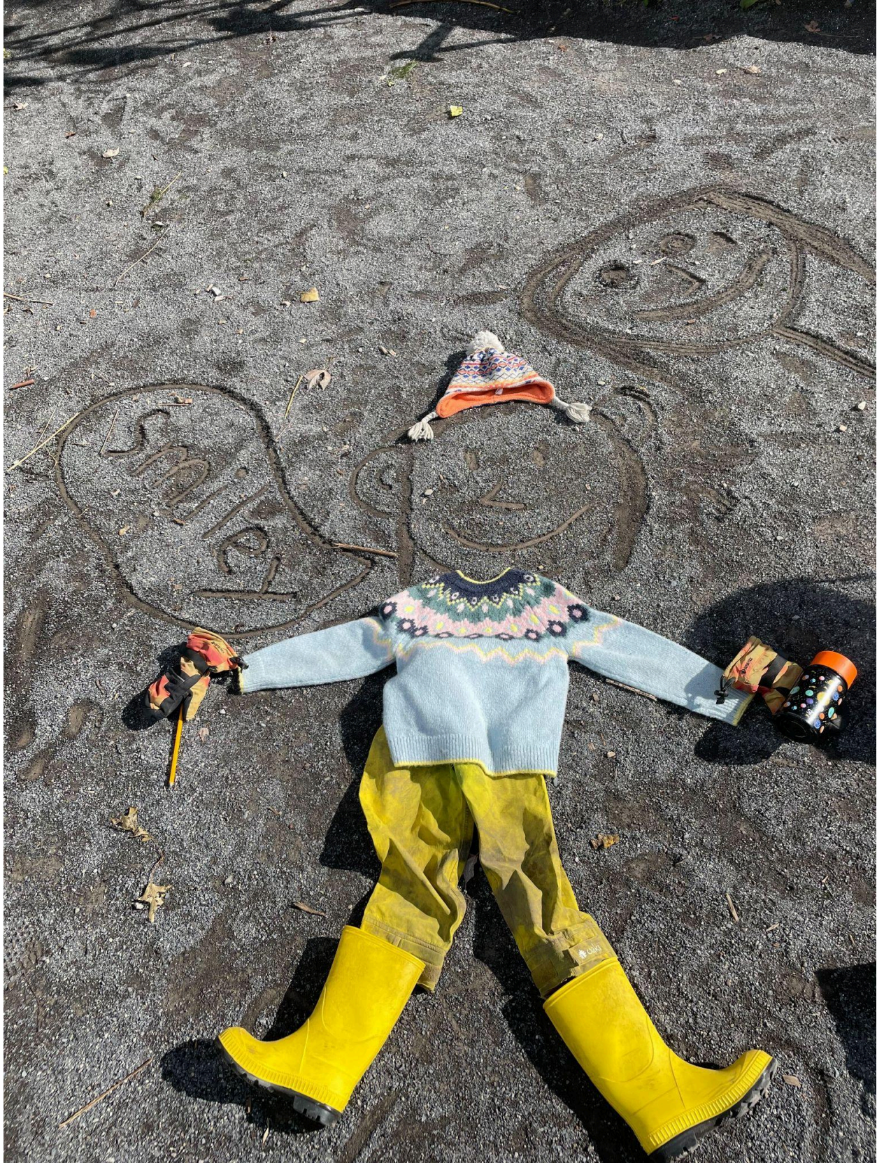
Visual Guide to Dressing for the Cold